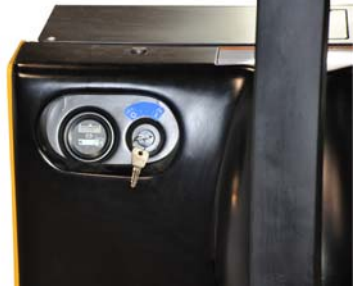
HOUR METER BDI AND KEY STANDARD